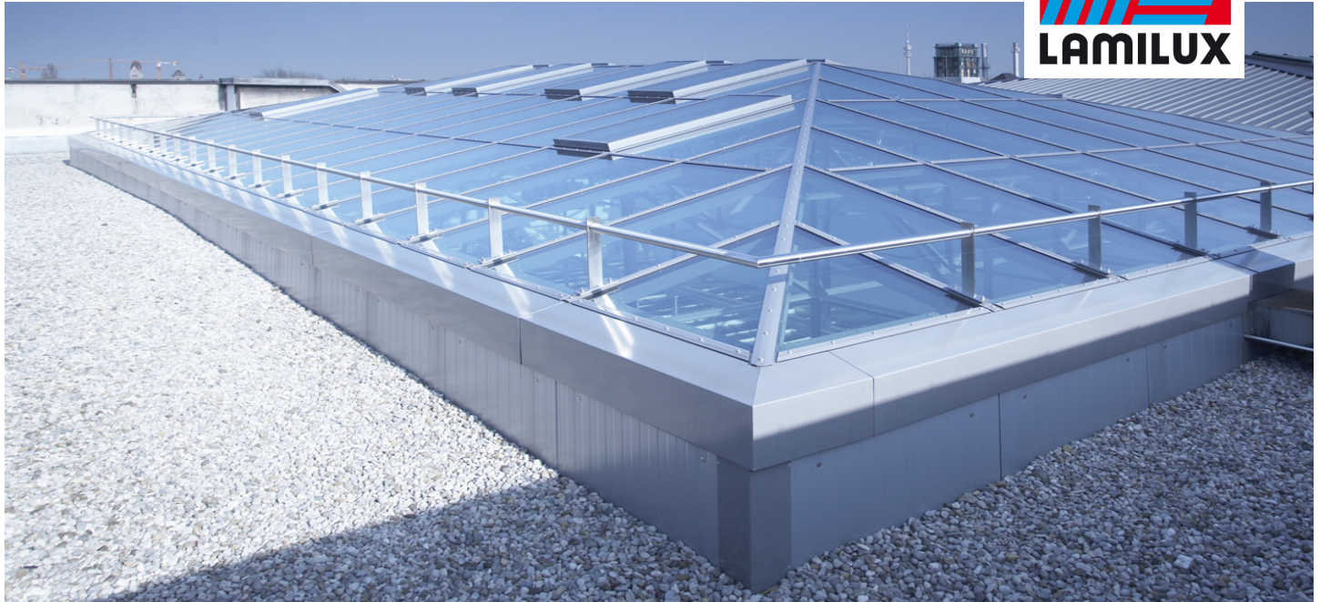
University of Music and Performing Arts, Munich