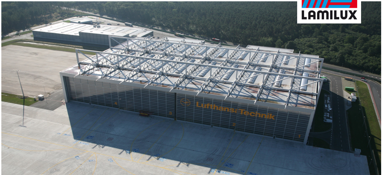
A380 Assembly Hangar